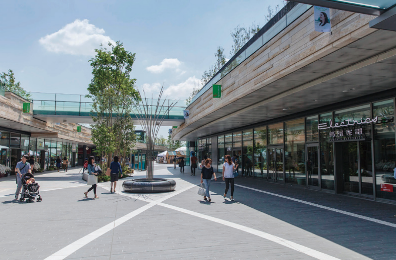
Futako Tamagawa Rise S.C.